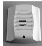
Indoor Wall Horn/Strobe