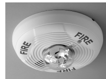
Indoor Ceiling Horn/Strobe