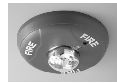
Outdoor Ceiling Strobe