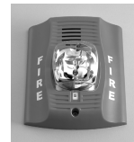
Indoor Wall Horn/Strobe