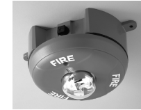
Indoor Ceiling Strobe