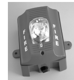
Outdoor Wall Strobe