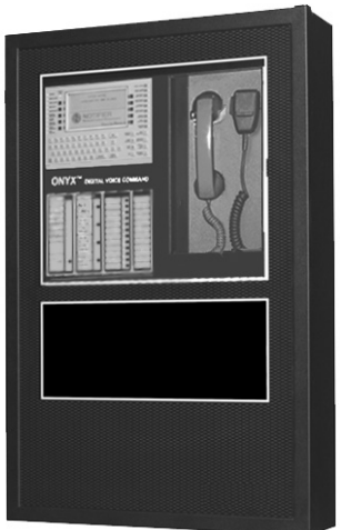
NFS2-3030 (left) and NFS2-3030 with DVC audio option (right)